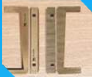
Flate & Profile Blade