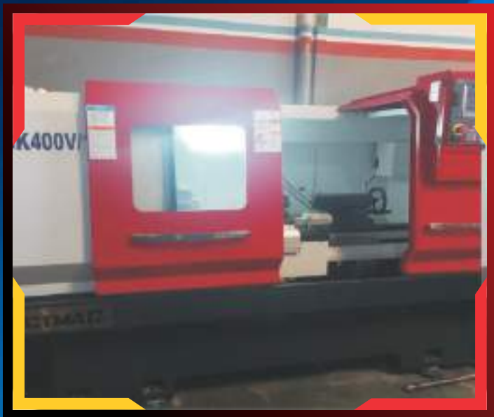
CNC BUBUT LATHE