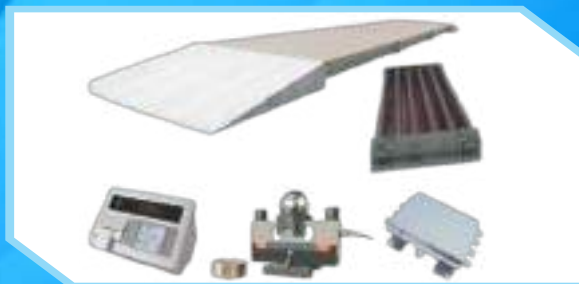
Truck Scale System