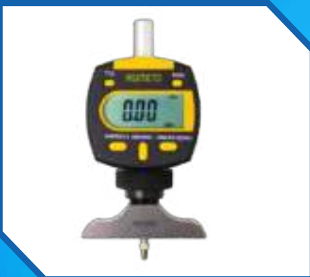
Dept Gauge Digital