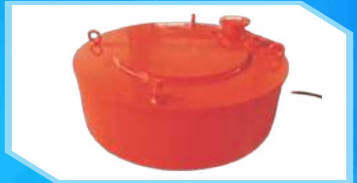
Permanent Magnet Saparator