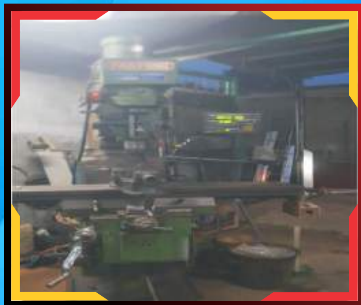
MACHINE SURFACE GRINDING