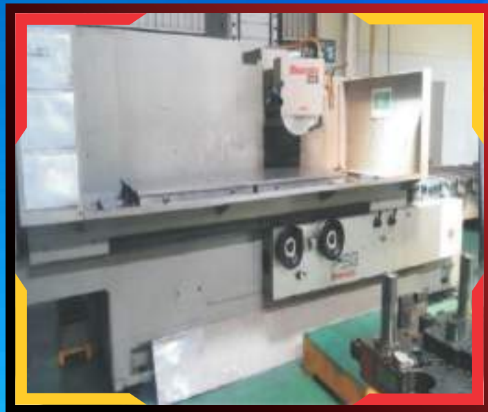
MACHINE SURFACE GRINDING