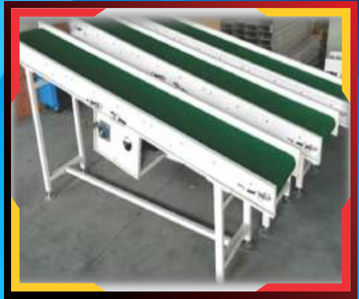
FABRICATION FRAME CONVEYOR