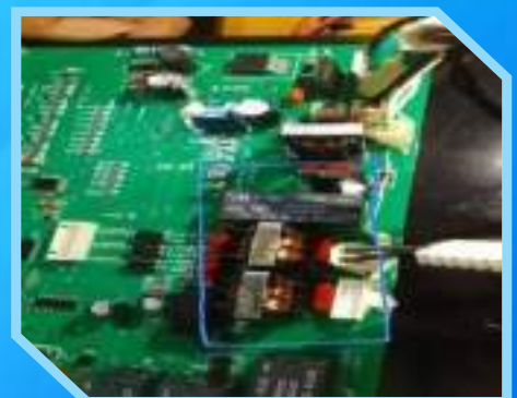
Repair Module High Voltage