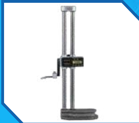
High Gauge Digital