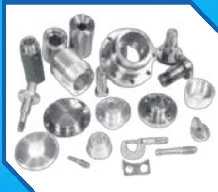
Jig & Part