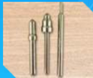
Semi Finish Tools