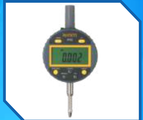
Dial Indicator Digital