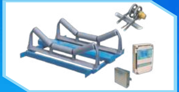
Belt Scale System Single Loadcell