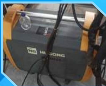
Repair Inverter Cut Plasma Cutting