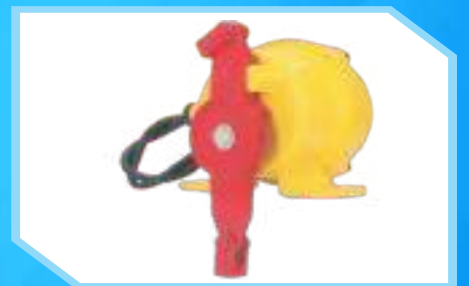
Pull Rop Safety