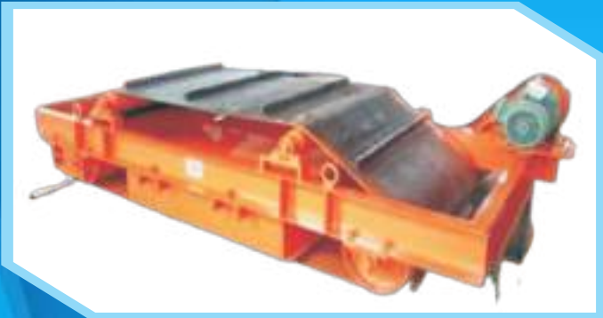
Self Electro Magnet Saparator