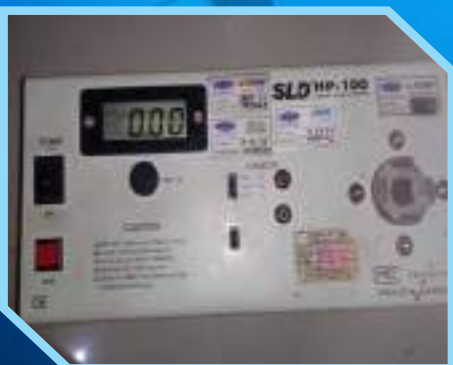
Repair Torque Check