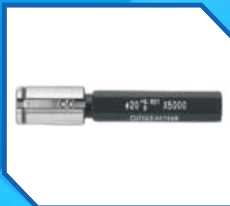
Plug Nozzle Air Gauge