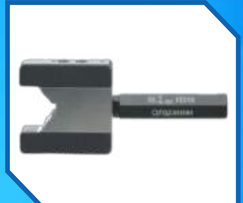
Snap Nozzle Air Gauge