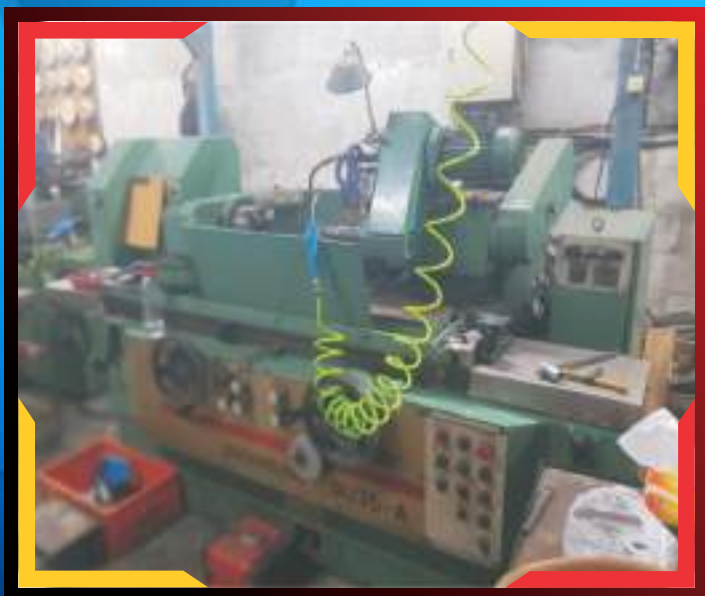
MACHINE CYLIDRICAL GRINDER MANUAL