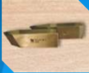
Diamond Tools For Cutting Carbide