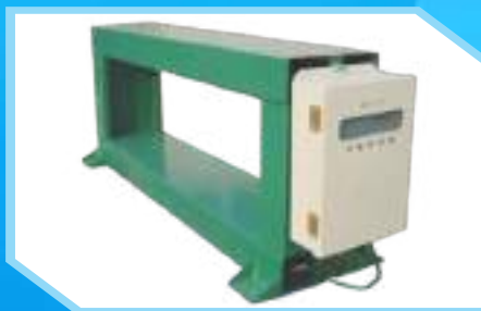
Auto Metal Detector